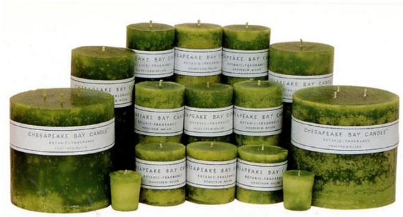
Exhibit 3 Product Examples